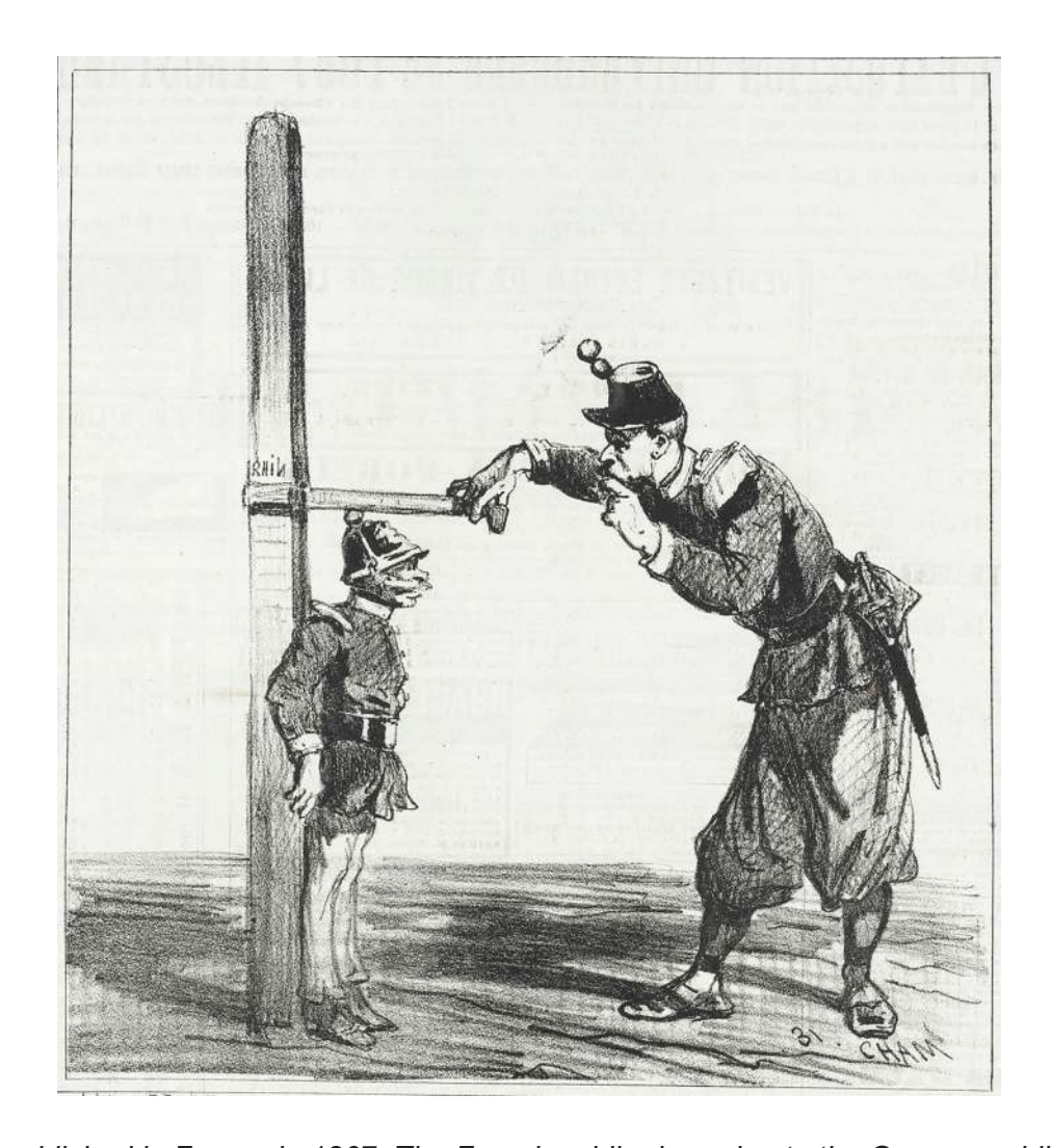
A cartoon published in France in 1867. The French soldier is saying to the German soldier, 'Now you are big enough. You must not get any bigger. I'm telling you this for your own health.'