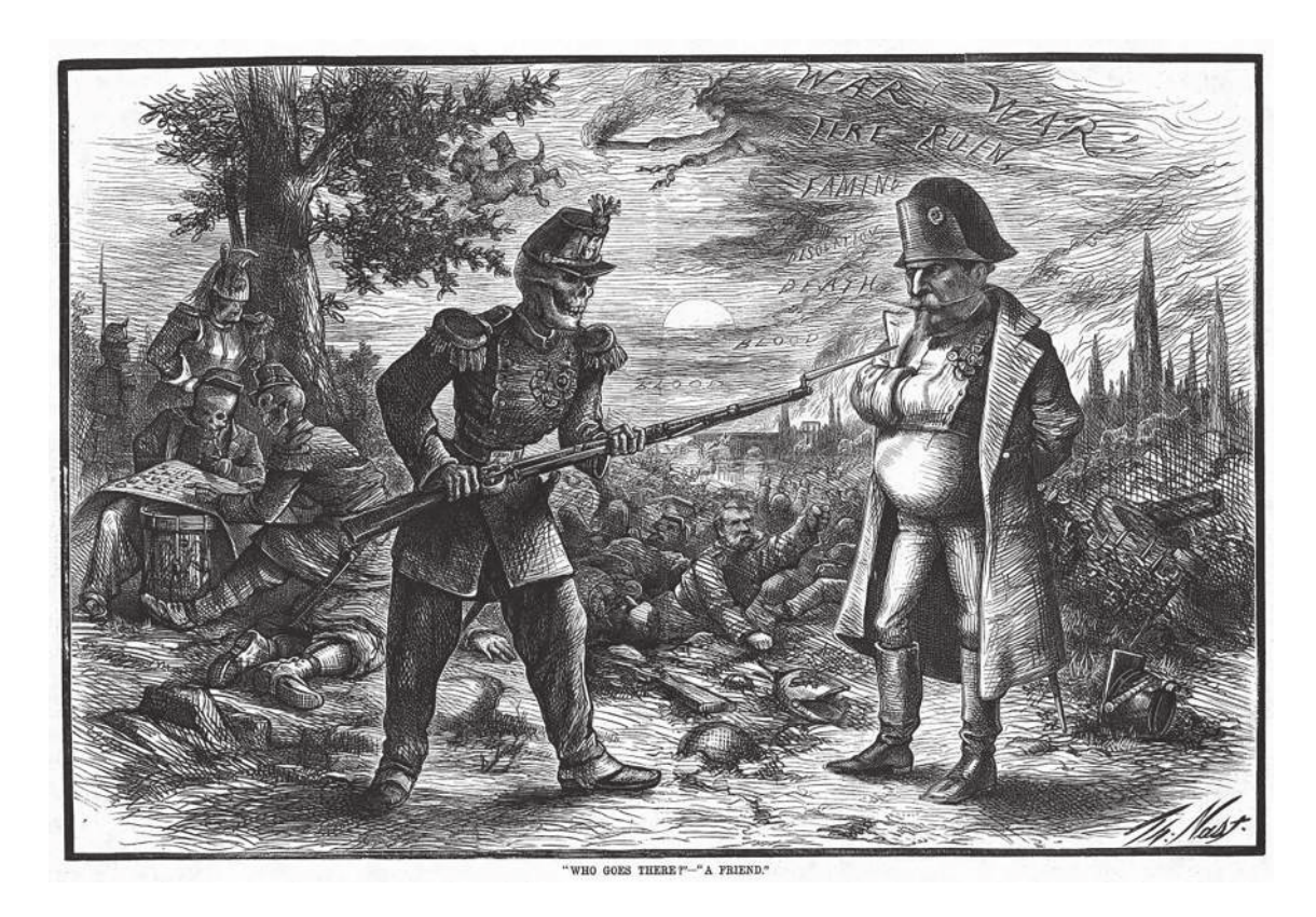
A cartoon published in an American magazine, August 1870. Death is saying, 'Who goes there?' and Napoleon III replies, 'A friend'. Around Napoleon are the words 'War', 'Fire', 'Ruin', 'Famine', 'Desolation', 'Death', 'Blood'.