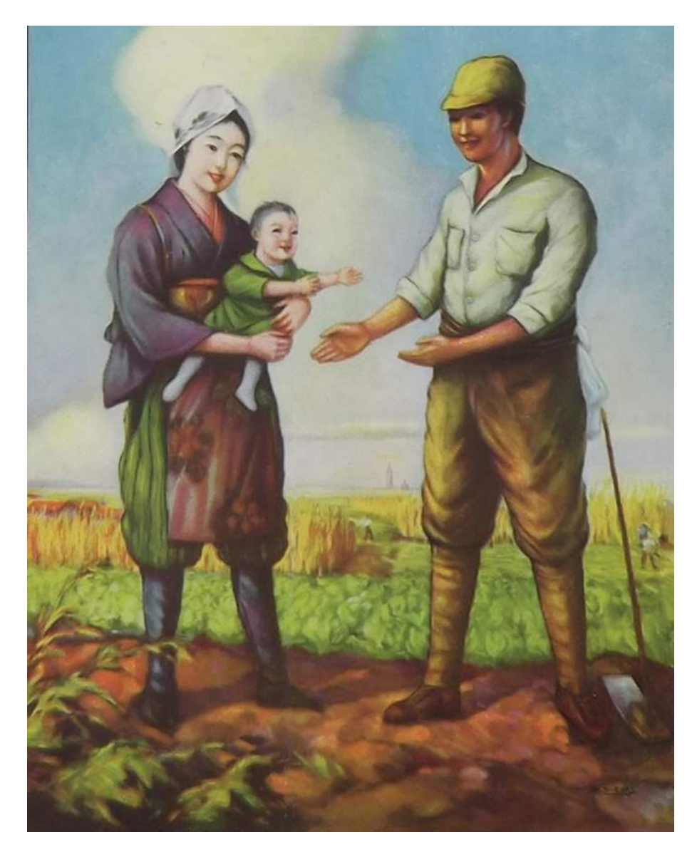
A poster published by the Japanese government in 1936 to celebrate the fifth anniversary of the Mukden Incident. It shows Japanese settlers in Manchukuo.